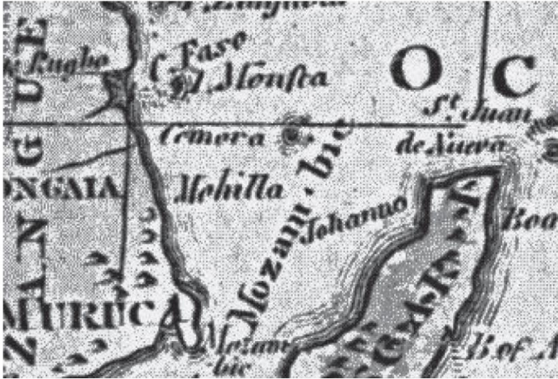
1808 Map of Africa

If the Americas were filled with hundreds of thousands of ancient Semitic people and their buildings—and seeing as researchers have found mountains of evidence chronicling the histories of the Mayans, Aztecs, Cherokees and so on—what happened to all the evidence of these great Mormon civilizations? Let’s ask the Smithsonian Institute: