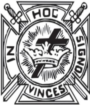
Former Watchtower icon

Notice the similarities between the emblems of the Luciferian Freemason Society and the Watchtower Society. For 40 years, the first logo was printed on the Watchtower magazines. It was quietly removed in October 1931.